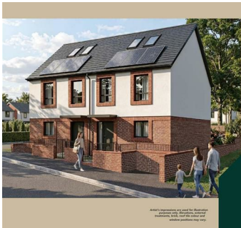
Plots 3 & 4 3 Bedroom Semi-Detached Priory Road

An excellent opportunity to purchase a brand-new home in an established residential setting.