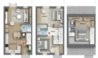
Ground Floor Living/Dining - 31.4m 2 Kitchen - 7.4m 2 WC - 1.7m 2 Store - 4.8m 2 Rear Deck - 6.8m 2 First Floor Bedroom 1 - 16.2m 2 Bedroom 2 - 11.3m 2 Bathroom - 6.5m 2 Landing - 3.8m 2 Store - 5.8m 2 Second Floor Bedroom 3 - 12.9m 2 En-Suite - 2.8m 2 Store 1 - 2.8m 2 Store 2 - 2.8m 2