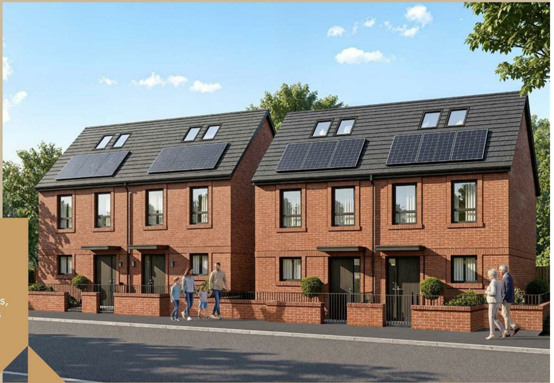
Artist's impressions are used for illustration purposes only. Elevations, external treatments, brick, roof tile colour and window positions may vary.

Offering practical layouts, energy-efficient features and modern finishes throughout